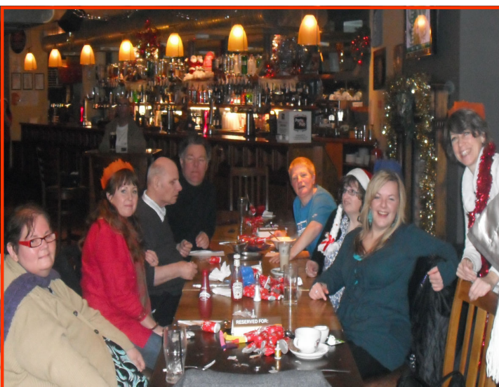
The Service User Group enjoying a Christmas Meal

The Service User Group had a fabulous Christmas meal at the Goscombe Pub, Cardiff. We all enjoyed a 3 course dinner, with Christmas crackers, paper hats and jokes. Even the snow couldn't stop us from celebrating! Thank you to our Service User Group for all their commitment in 2010.